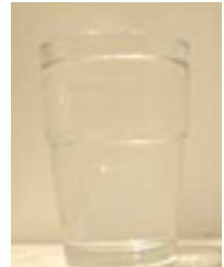
7b. Full glass (25%)

Step 10: Notice in the #11 & 12 picture below that a piece of white tape has been put on narrow container #1. But don't attach the tape until that first container is floating in the second one. Then put the tape in place and