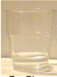
7a. Glass eighth full (3%)

Step 9: Pour some water into narrow container #2. Use a little more water than is in the first one because the first one must float in the second one without touching bottom. Now, if we do the following steps properly we will have 28% \text{NaClO}_2 by weight in the coffee pot.