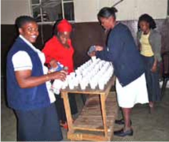
Jim's helpers preparing MMS doses for the 500 students

On about the 4th day I was there, Zondo moved the bunch up to the mountain top where his hospital was being built. I was supposed to begin teaching MMS classes to a group of 50 students that he picked