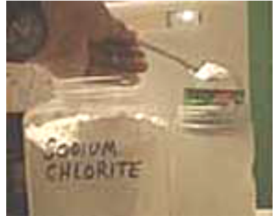
11 & 12. First container taped and marked. Add \text{NaClO}_2 to same mark.

At this point, if you did use a coffee pot for the mixing container, you could warm the water in the coffee pot on a stove, electric or gas. Do not boil the water. Do not put the \text{NaClO}_2 in the pot until you have removed it from the stove. Then add it and mix until dissolved.