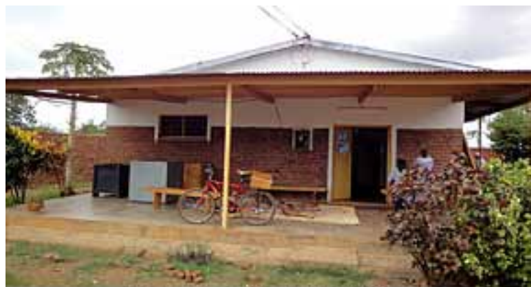
Jim's bike at the Herbal Clinic

Finally, after spending a thousand in one month, I bought a bicycle. It cost $100 and I had one of the carpenter shops make a wooden box and mount it on the back. The box was big enough for most of the things I carried and if something was too big, I tied it on top of the