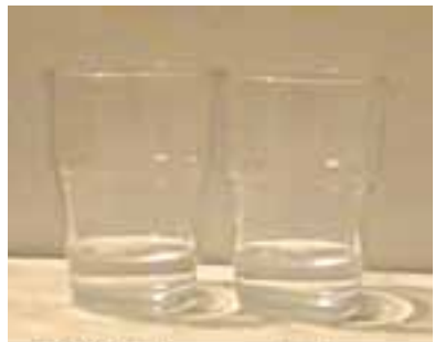
5 & 6. Two containers eighth full (3.125% ea.)

Step 8: Pour the 25% and the 3% into narrow container #1. Now there is 28% of the water's weight in this container and the rest is in the coffee pot which now has 72% (rounded off). Now we need to put 28% NaClO 2 in the coffee pot because that is how much water we