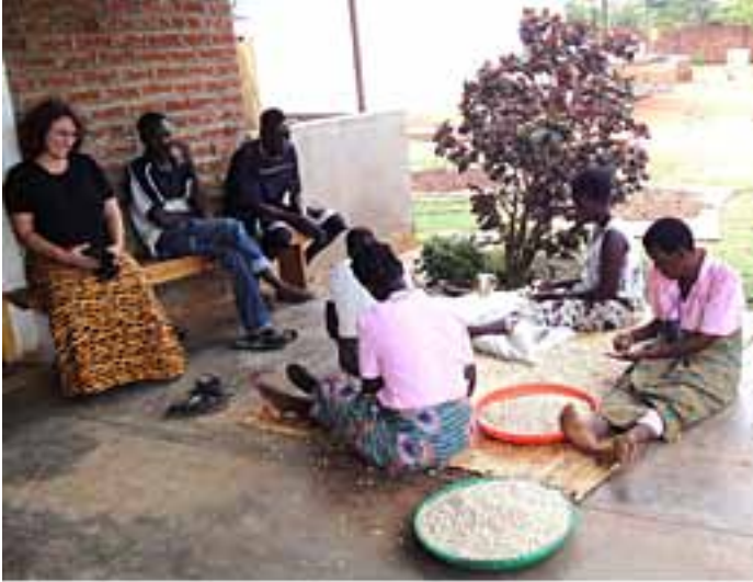
Making herbal powder at the Herb Clinic

Within the first week they had all lost their various health complaints.