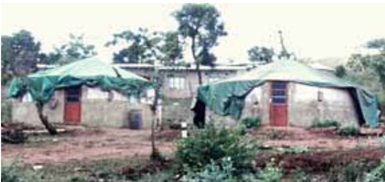
Round houses in the Zulu complex

These houses have no partitions. They are just a big round building with beds, TVs, couches, chairs, and other electronic items and clothes. The food is prepared and served in another house. Bathing is done outdoors, normally in a bucket of water. The weather is usually warm so this is possible most of the year. The toilet is an outhouse.