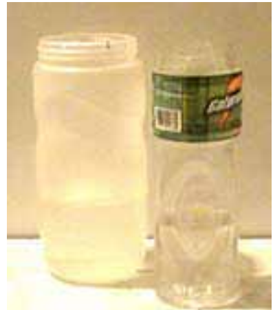
9 & 10. 28% water weight in 1st narrow container and more in 2nd

Step 11: Now that narrow container #1 is taped and marked properly, you must pour the water out, dry out the container, and put sodium chlorite powder in it. Do you see? We want the sodium chlorite powder to lower the floating narrow container #1 exactly the same amount as the 28% water did. In other words, the \text{NaClO}_2 powder weight will be 28% of the water weight in the coffee pot. So we carefully work with the floating mechanism until we are satisfied that we have the same weight of powder in narrow container #1 as the weight of water before we poured it out and dried the container.