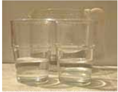
4. Two containers quarter full (6.25% each)

Step 4: Take the remaining 12.5% container and pour half of it into the container that you just emptied into the coffee pot. Make sure that both containers have an equal amount of water in them. Use a spoon or even an eye dropper to make sure they are even. Now both containers have 6.25% of the whole amount of water we started with. We don't need one of the 6.25% waters, but don't discard it – it goes into the mixing container (coffee pot).