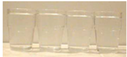
1. Four identical non-metal containers: 25% each of total water

Step 2: Take the third 25% container and divide it in half by pouring half of it into the fifth container which was empty to begin with. That's easy, as all you have to do is make sure the fifth and third containers have